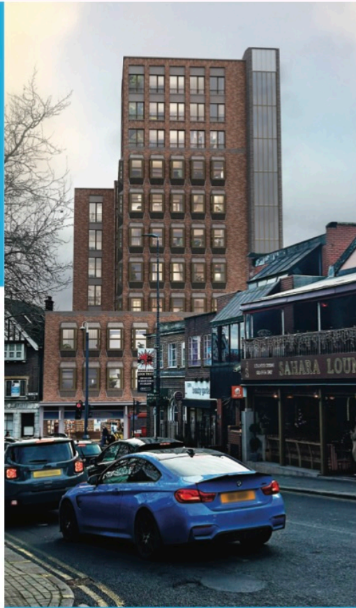
Computer generated image looking from Stanmore Hill

There are plans to add 9 much needed new homes to the site, as well as improvements to the general aesthetic with the unsightly phone masts on the roof being removed.